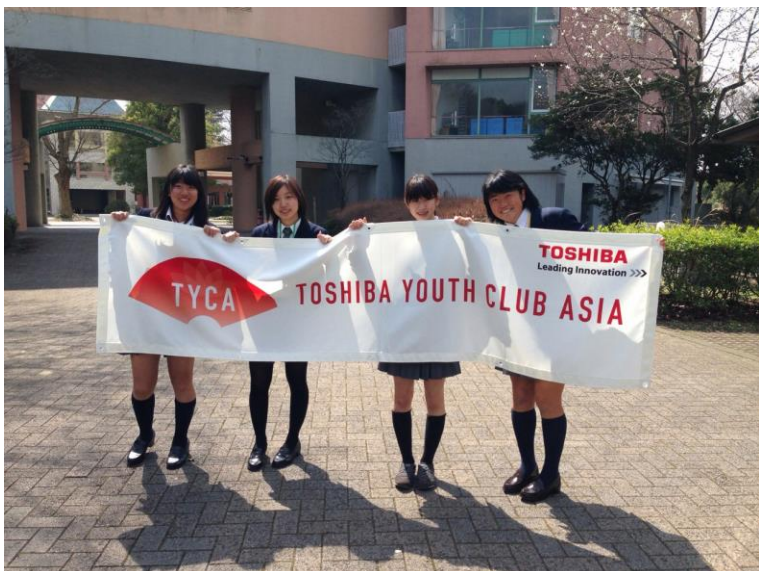
Warm greetings by the Japanese girls