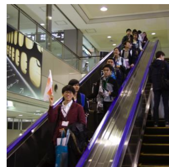
Participants from Laos, Vietnam, Myanmar and Thailand!