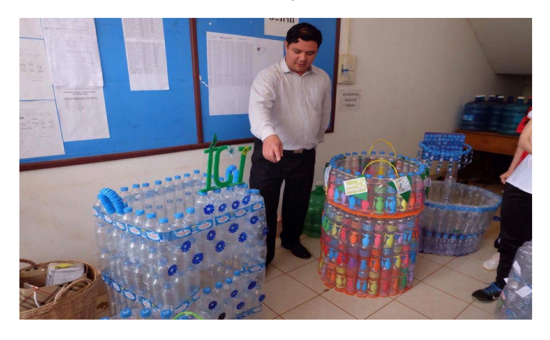
Finding the winner