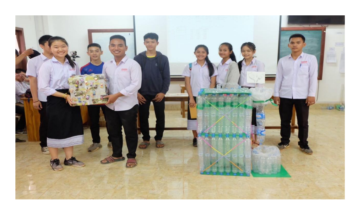
The winner team