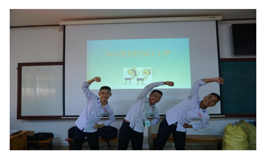
Warming up before start