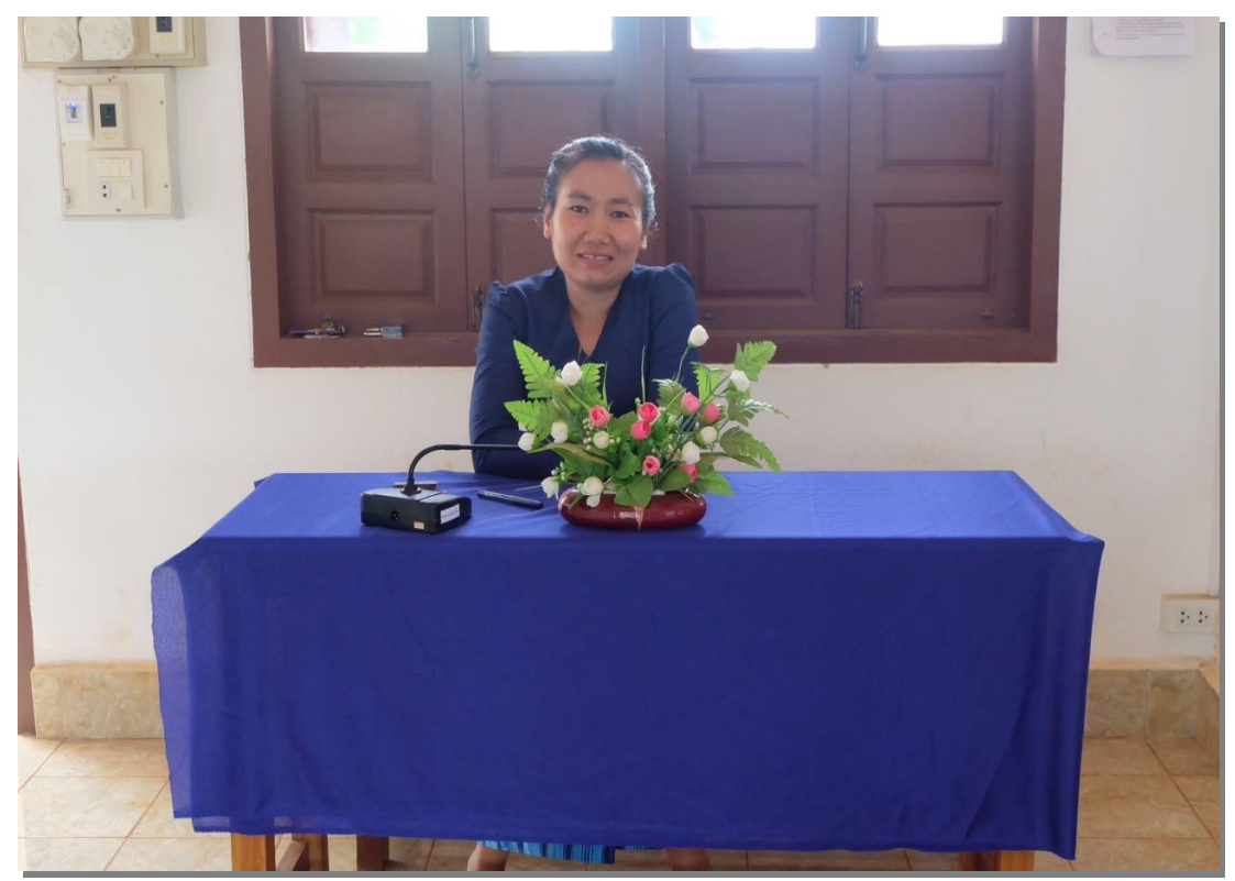
The invited teacher