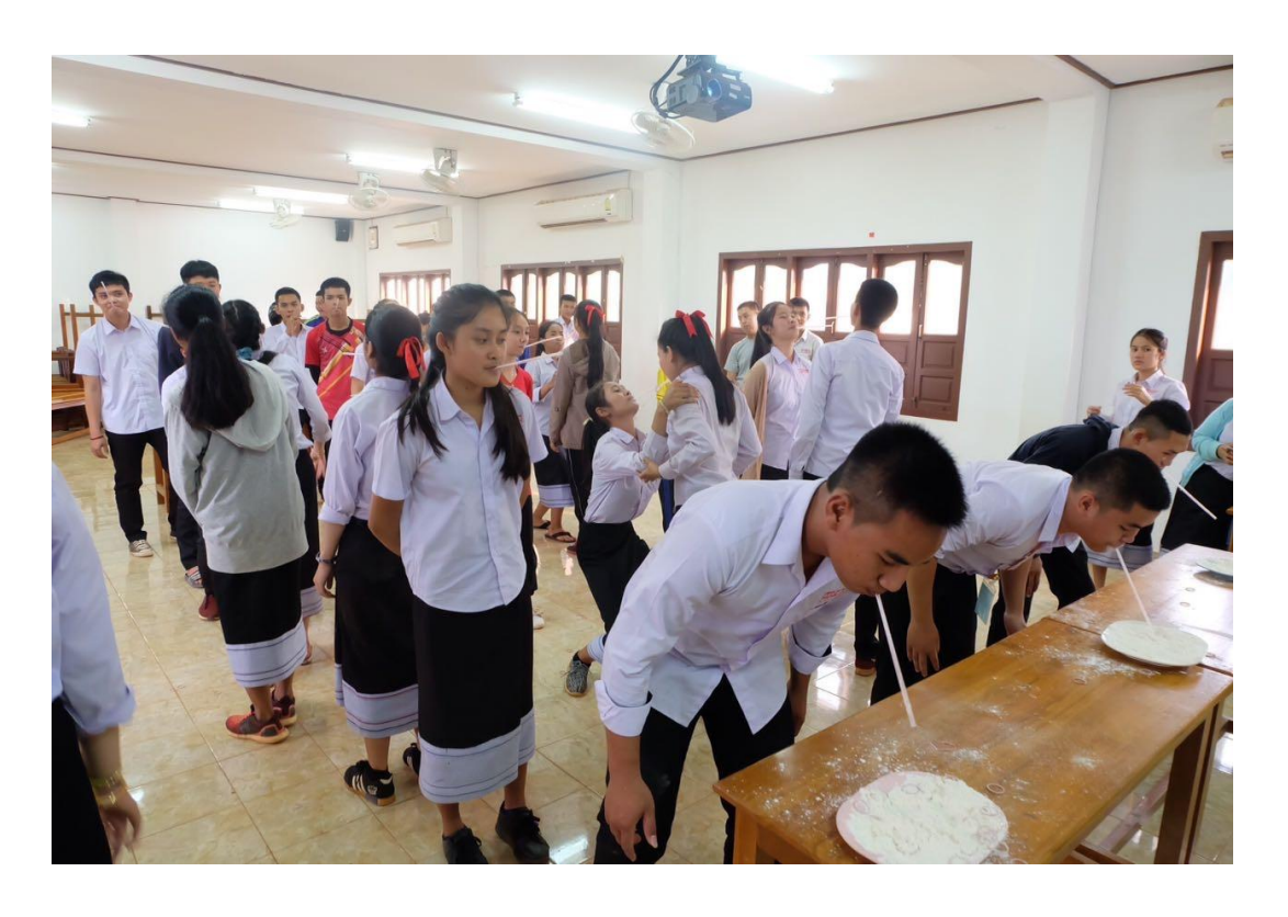
Playing some games