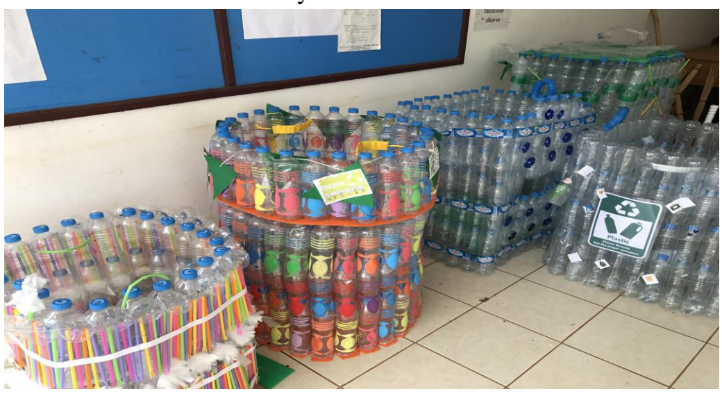
Our water bottle budgets handmade

We invited teacher to be a referee, and give us some advices and comments on our activity.