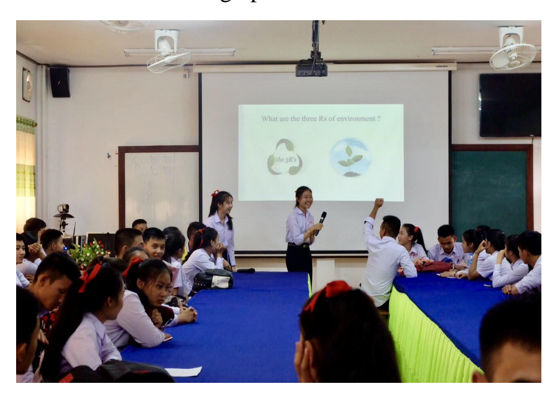
Q & A with participants again