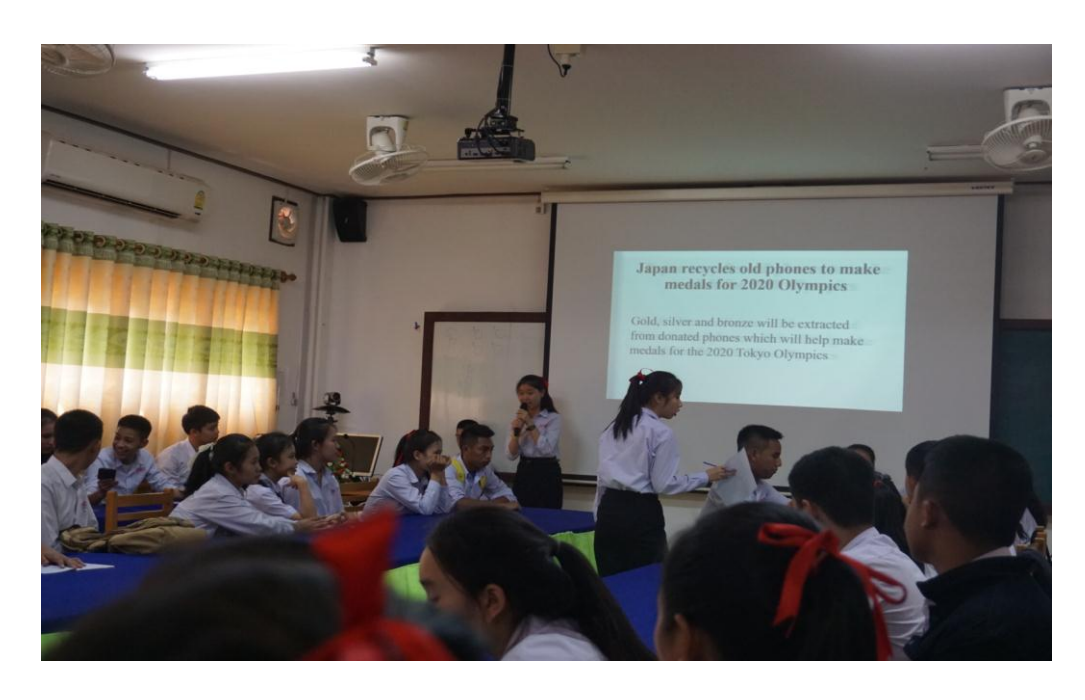
A bit talk about Japan