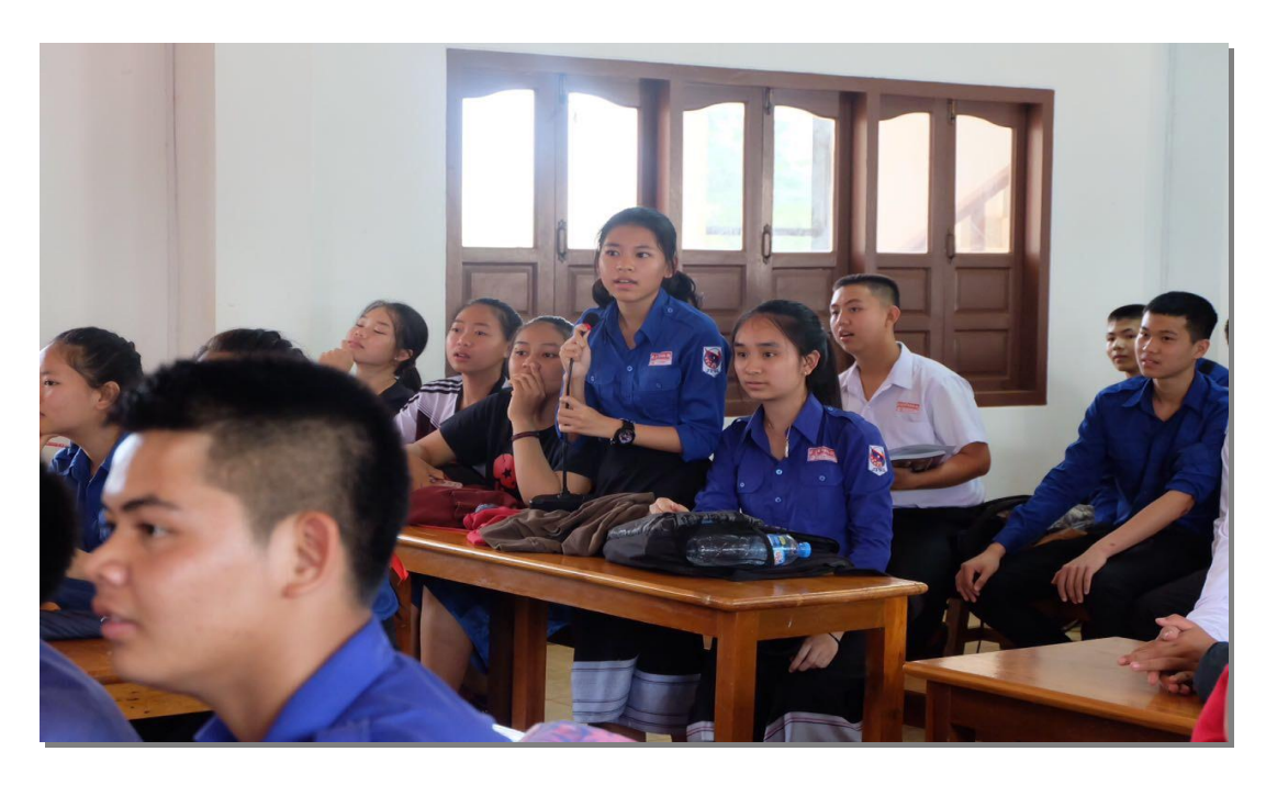
Doing some Q & A with participants