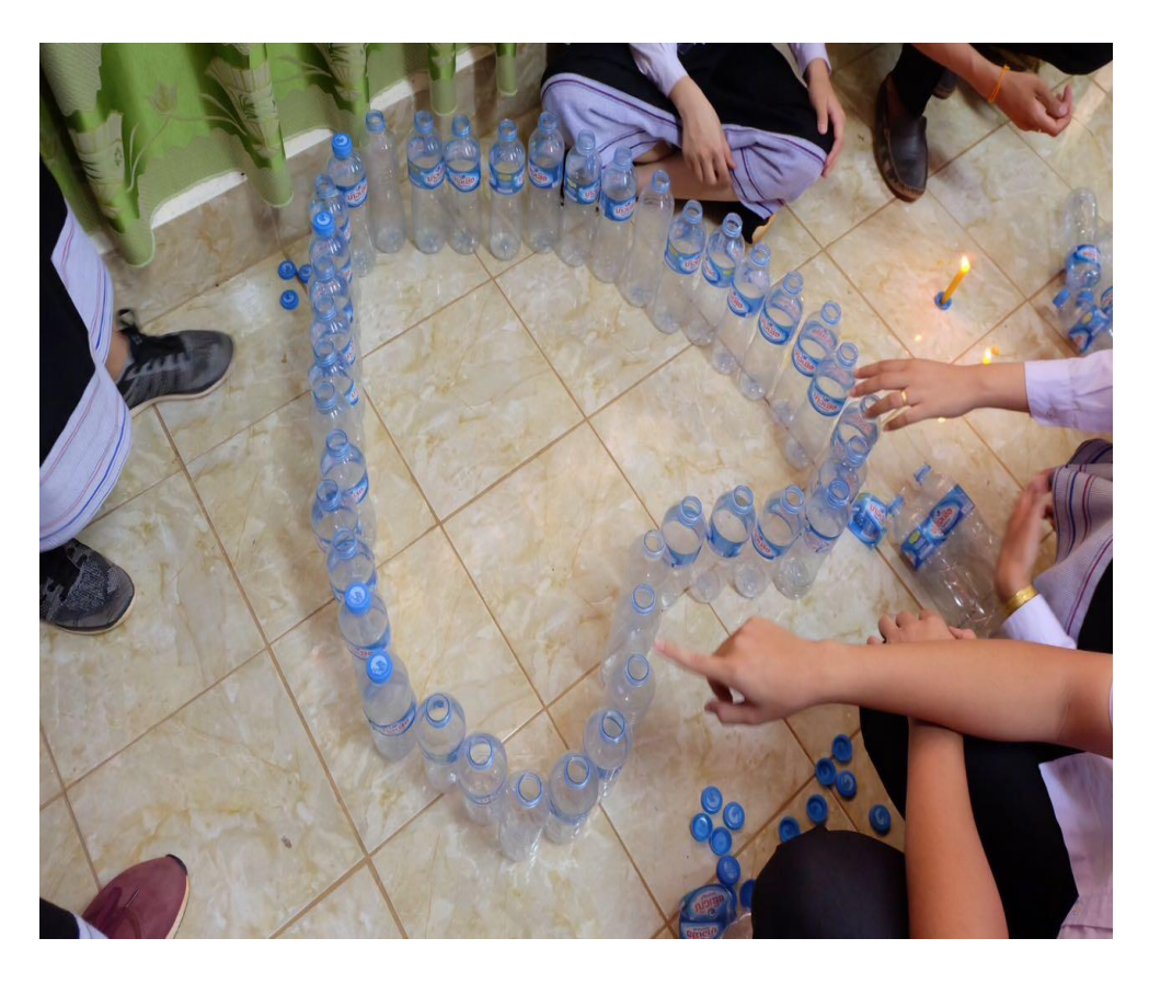
We make with love :)