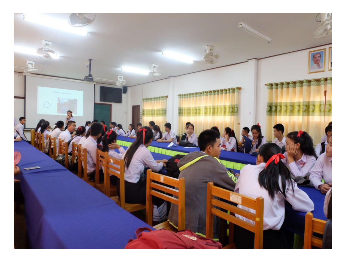
Giving them some suggestions before begin