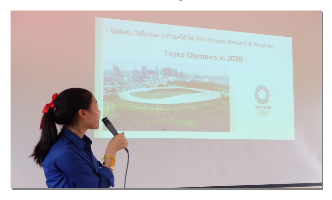
Me on my workshop